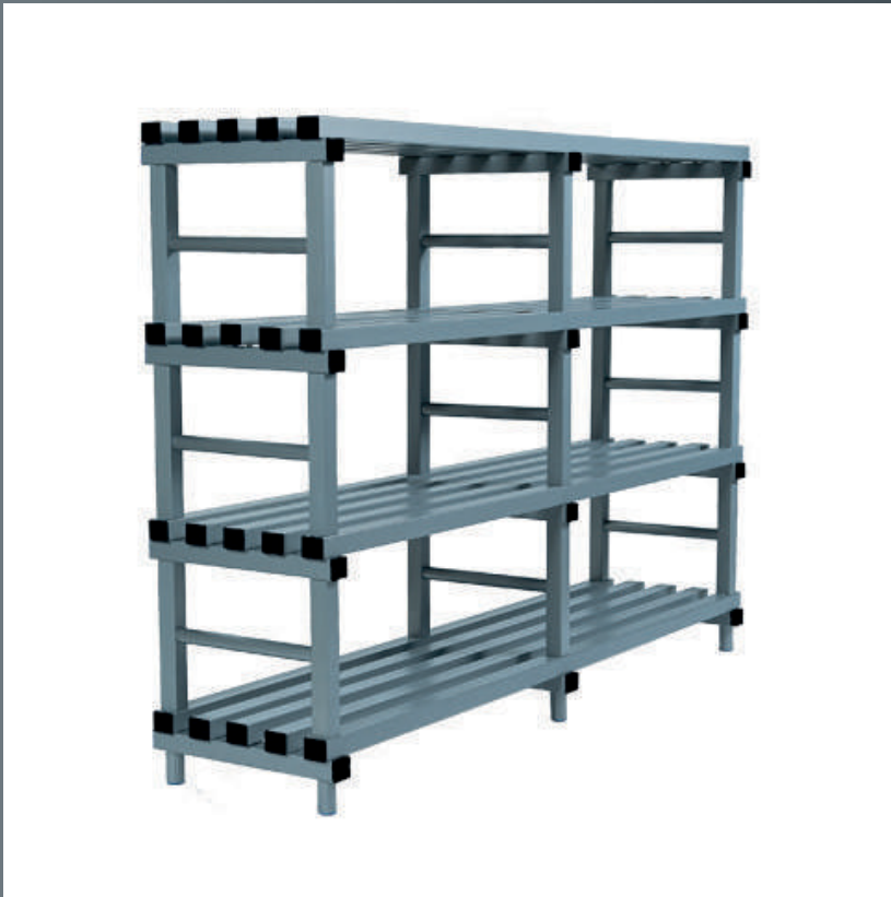
Modular Rack Series

Designed to fit all your needs. Easy to assemble, with no metal parts. Lightweight and durable for easy mobility.