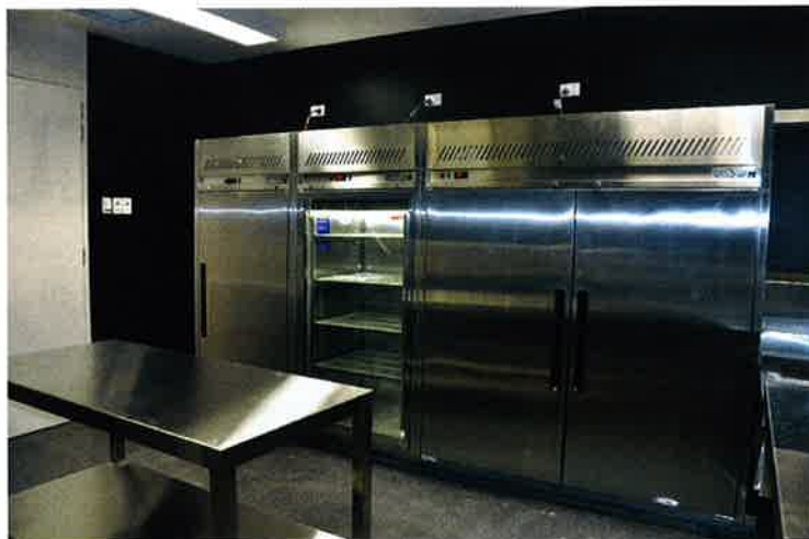
A Williams Refrigeration glycol installation.

the improved efficiency of refrigerators using R290, operators will find lower energy costs of up to 25 per cent and faster temperature reduction as well as longer compressor life and reduced maintenance costs. (You can see a comparison between a typical freezer cabinet using R404a HFC (hydrofluorocarbon) gas versus R290 (hydrocarbon) gas in the charts on the previous page).