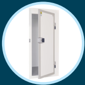
Right-hand swing hinge door