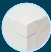
Rounded corner cap

A - External rounded edge B - Polyurethane foam C - Internal coved corner