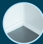
Internal coved corners and external rounded corners