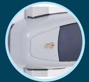
Key lock & internal safety release