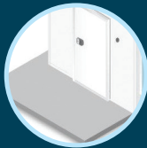
250kg roll-in flooring