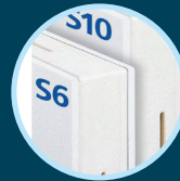
Polyurethane panel (PUR)