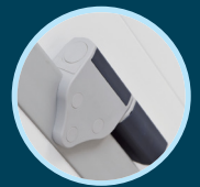
Durable and adjustable door hinges