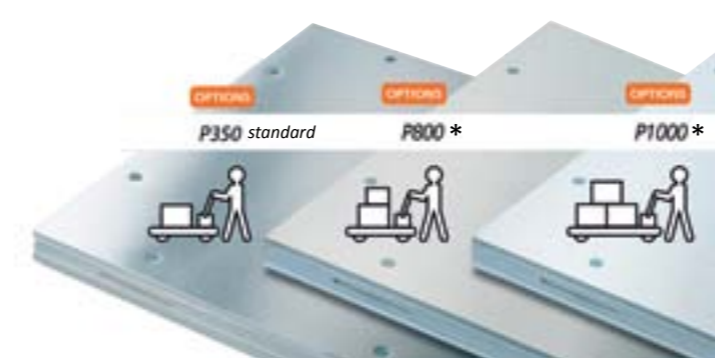
Flooring P350 standard, P800, P1000 and stainless steel options

Strip curtains, glass door inserts, hinge door, hatch doors and new easy glide sliding doors.