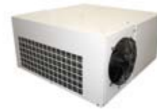
MISA Drop-In Unit